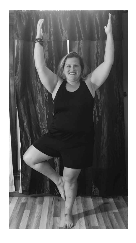
Tree Pose: Calf Variation