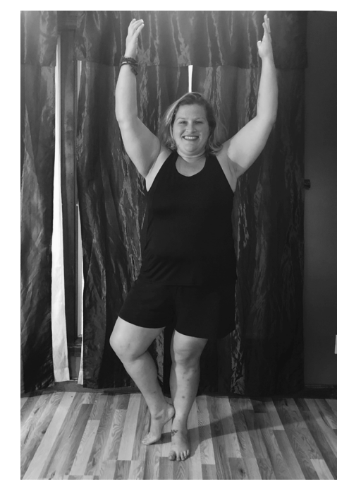
Tree Pose: Ankle Variation