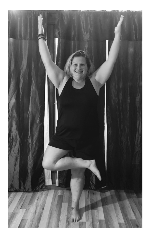
Tree Pose: Half Lotus Variation