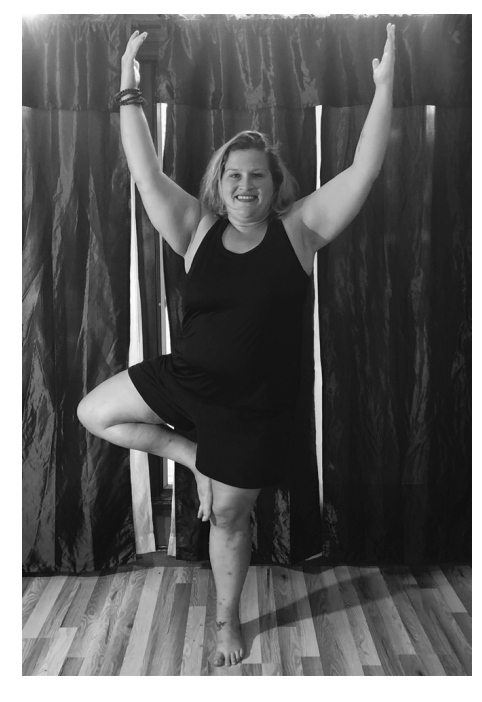
Tree Pose: Thigh Variation